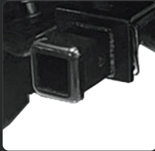
■ FRONT HITCH RECEIVER $435