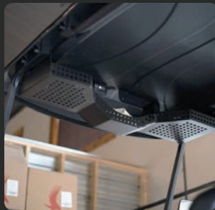
OVERHEAD STORAGE $575 (NOT AVAILABLE WITH LSV PACKAGE)