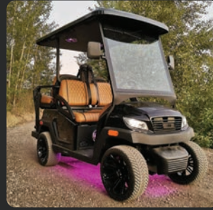
UNDER CART LED $795