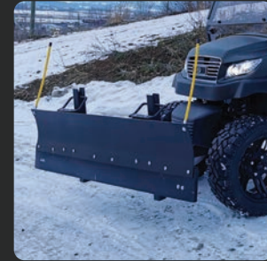
■ WNTR PLOW $1,995 (REQUIRES FRONT HITCH RECEIVER)