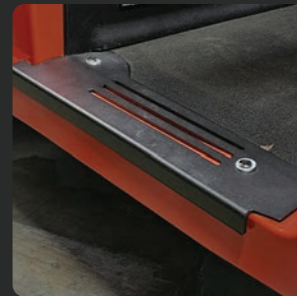
SIDE SILLS $695