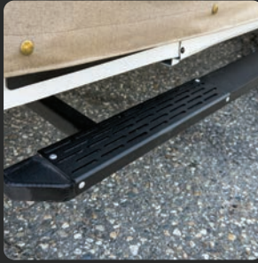
RUNNING BOARDS $1,795