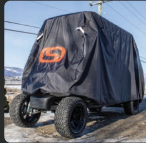
■ STORAGE COVER $495