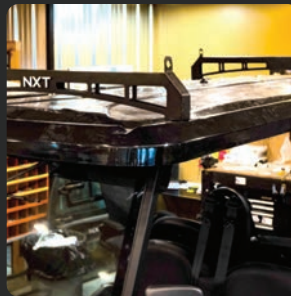
ROOF RACK $795