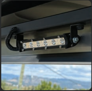
LED LIGHT BAR 6" - $125 12.5" - $255 37" - $395