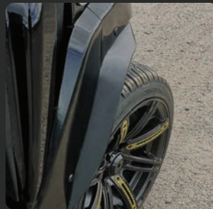
SPLASH GUARD FENDERS $375