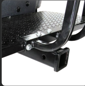
■ REAR HITCH RECEIVER $495