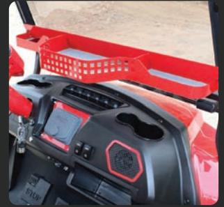
LOWER DASH TRAY $495