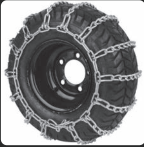
TIRE CHAINS $295 (SET OF 2) (REQUIRES LIFT KIT)