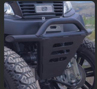
BULL BAR $695 (REPLACES LOWER VALANCE. INCLUDED WITH LIFT KIT)