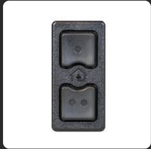
■ HOMELINK DOOR OPENER $315