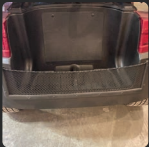
BACK MESH RETAINER $225