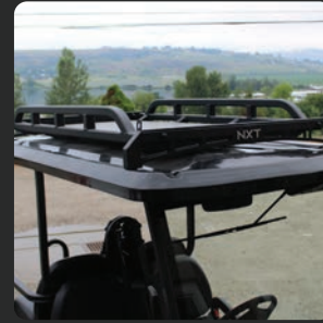
ROOF BASKET $1,295 (REQUIRES ROOF RACK)