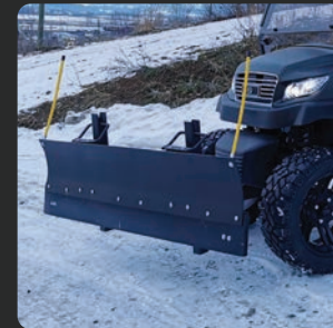
WNTR PLOW $1,995