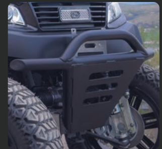
■ BULL BAR $695

(REPLACES LOWER VALANCE. INCLUDED WITH LIFT KIT)