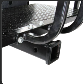
REAR HITCH RECEIVER $495