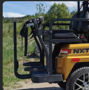
REAR BAG HOLDERS $595