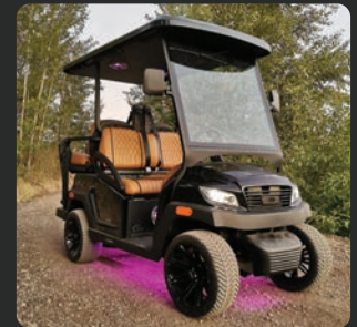
UNDER CART LED $595