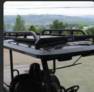
ROOF BASKET $1,295