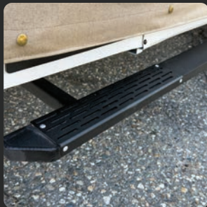
RUNNING BOARDS $995