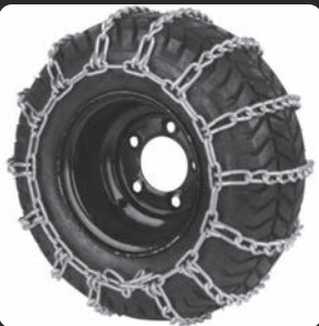
TIRE CHAINS $295