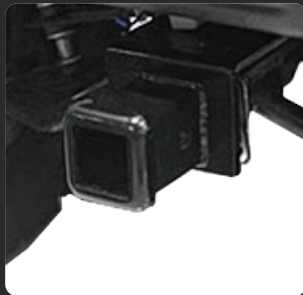
FRONT HITCH RECEIVER $435