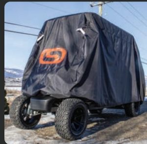
STORAGE COVER $395